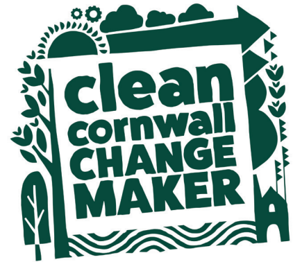
Mount Pleasant Eco Park